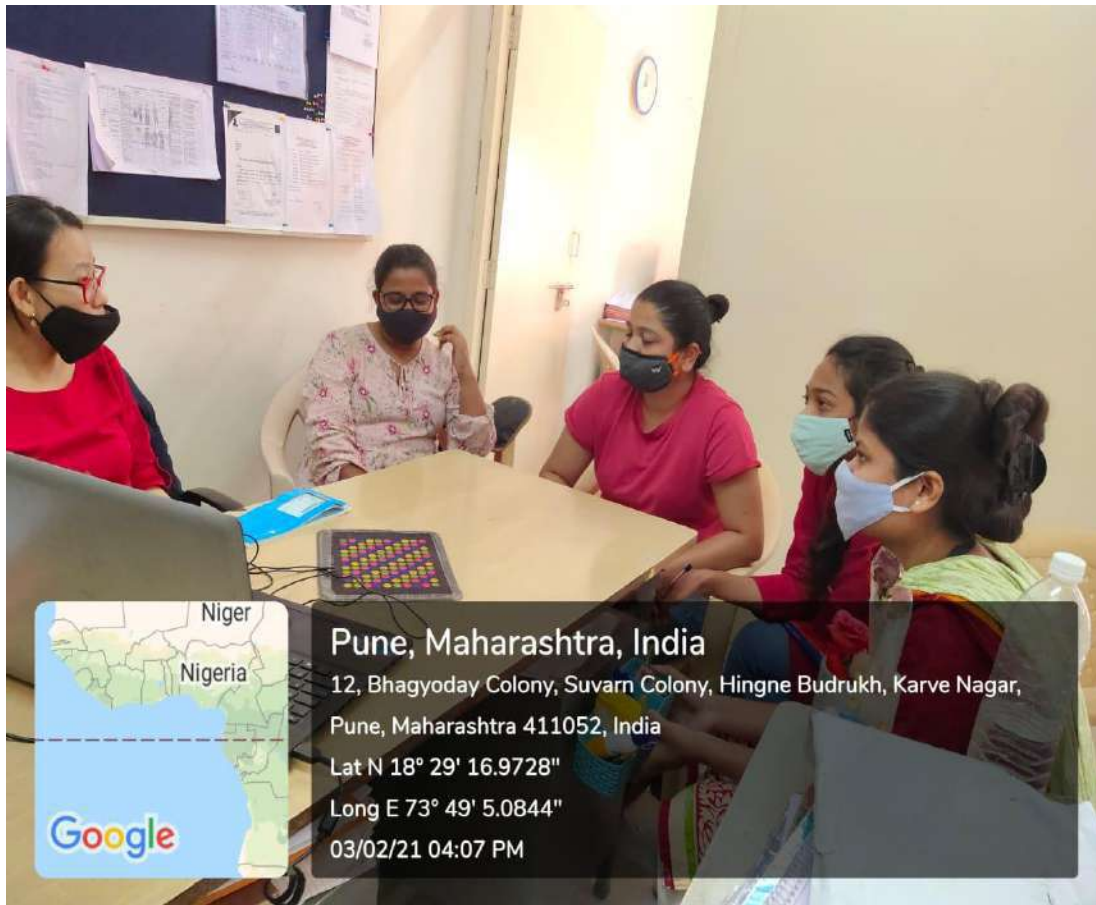
Fig.: Start-up meeting and brainstorming for innovation and incubation in progress (03/02/2021)