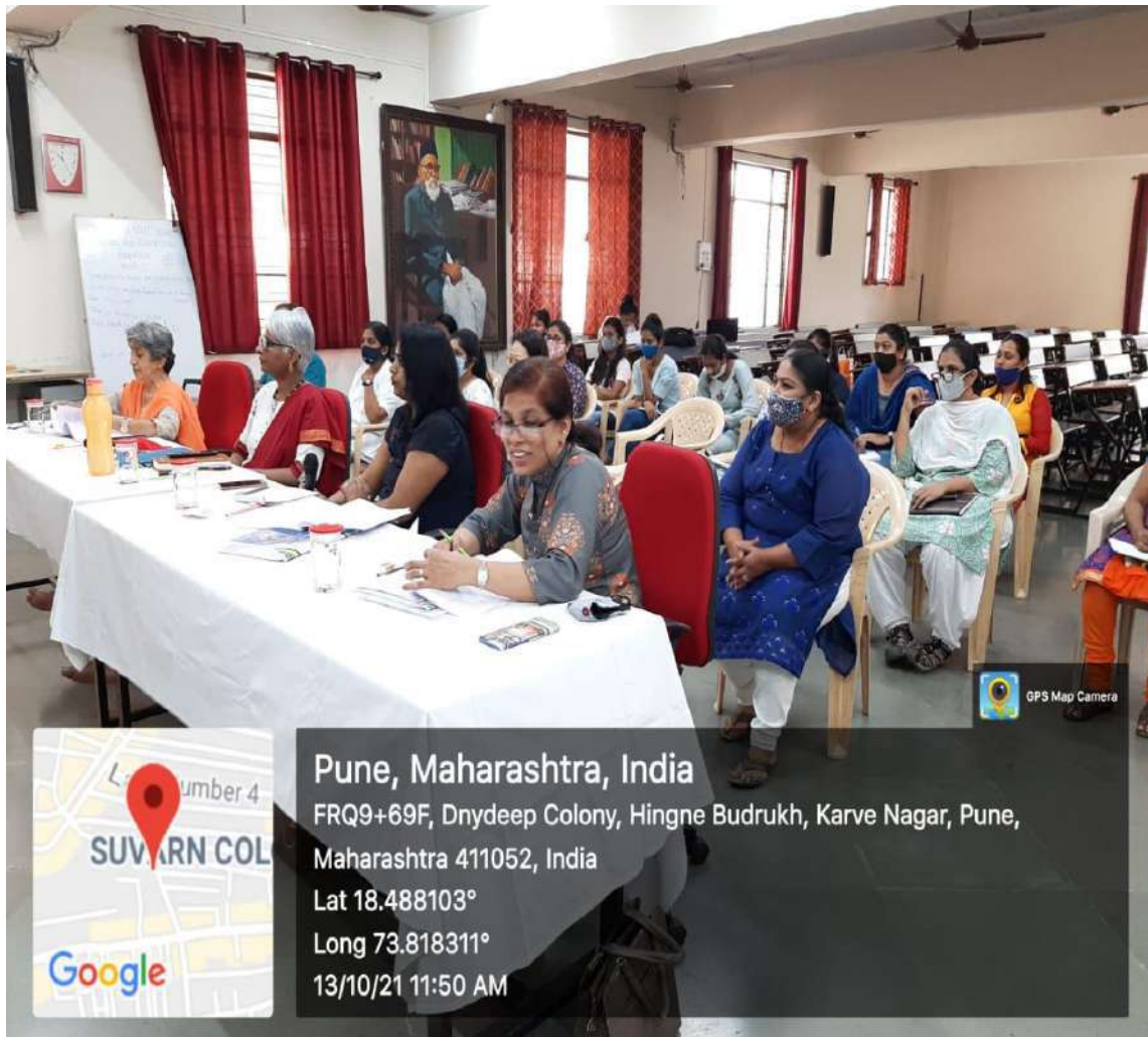
Photo: Research methodology workshop in session.