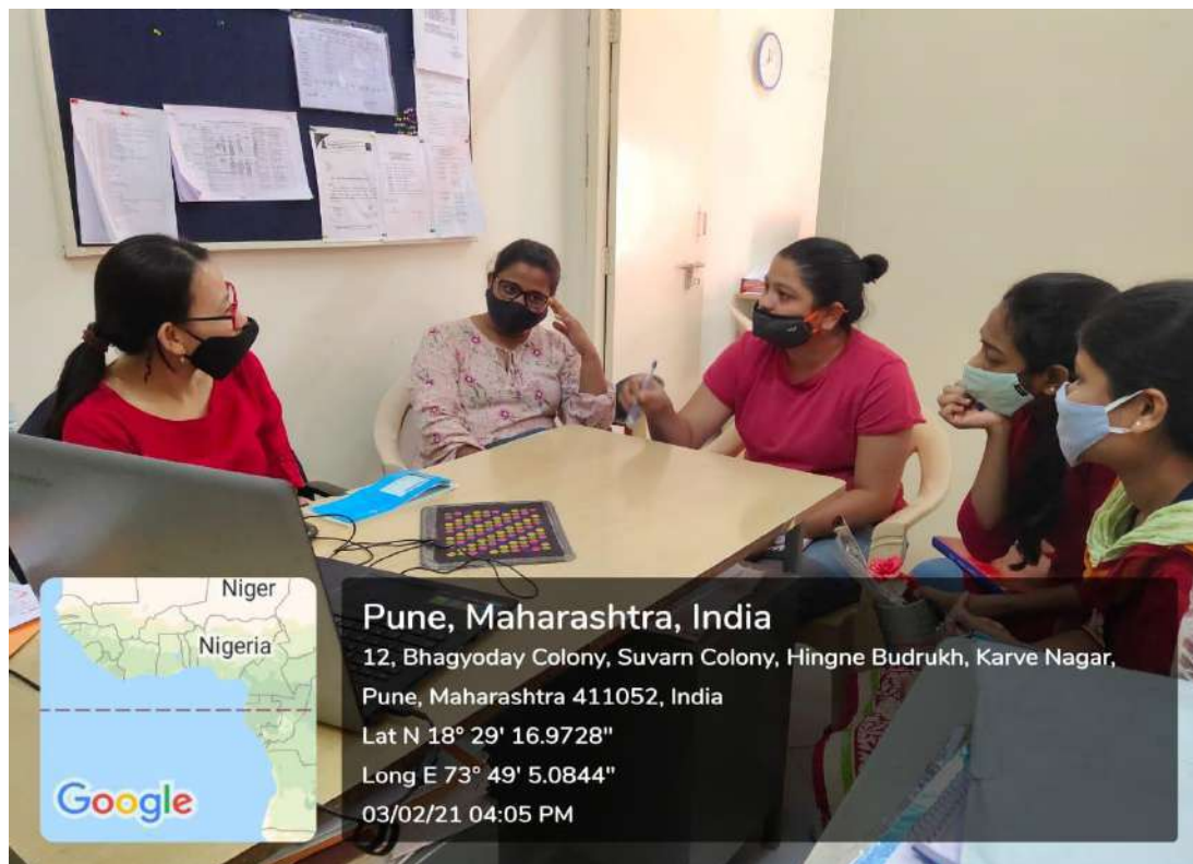
Fig.: Start-up meeting and brainstorming for innovation and incubation in progress (03/02/2021)