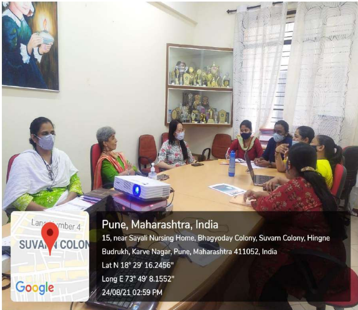
Fig.: Start idea presentation by students and its related discussion about pros and cons, feasibility (24/08/2021)