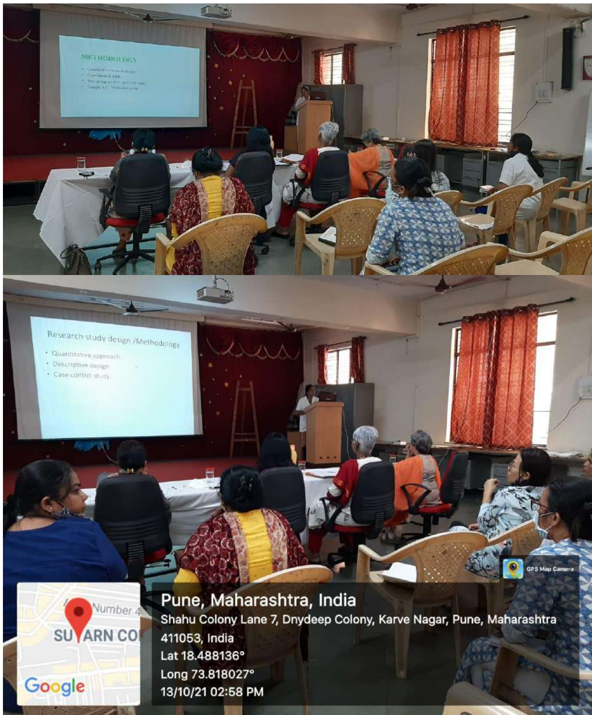
Photo: PhD scholar research presentation in session.