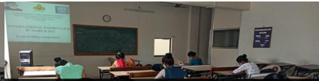
Cummins College Road, Karve Nagar, Dnydeep Colony, Hingne Budrukh, Karve Nagar, Pune, Maharashtra 411052, India