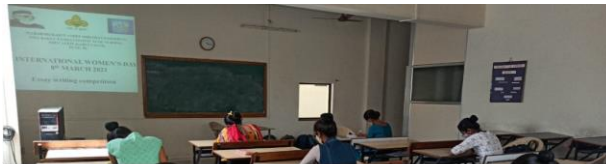
Cummins College Road, Karve Nagar, Dnydeep Colony, Hingne Budrukh, Karve Nagar, Pune, Maharashtra 411052, India