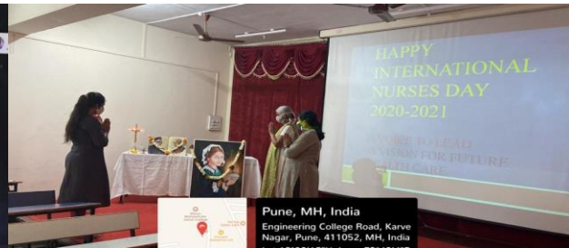
Pune, MH, India Engineering College Road, Karve Nagar, Pune, 411052, MH, India