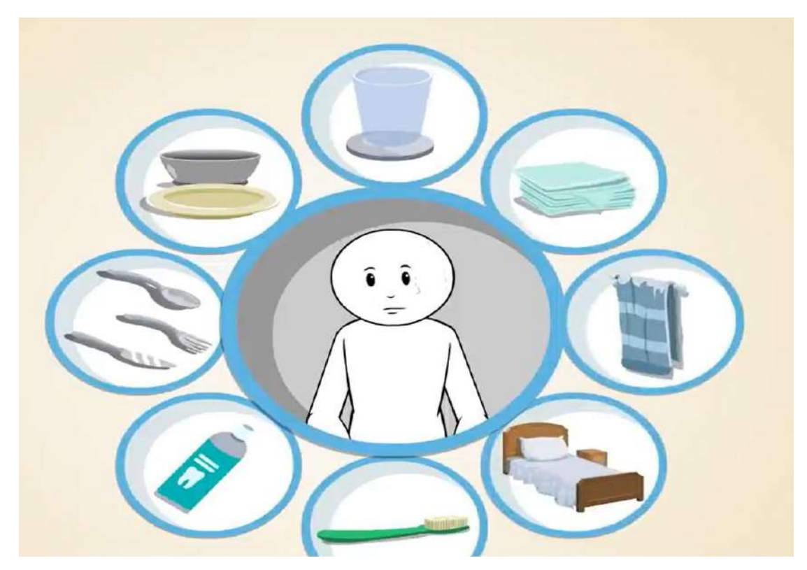
DO NOT SHARE